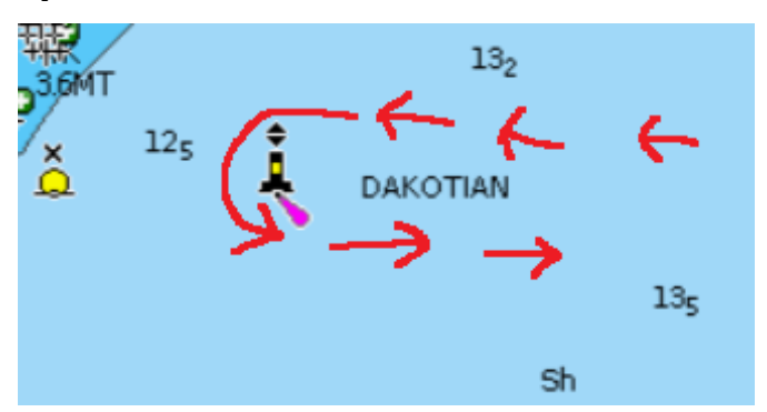
d) Mark 3: Llawrenny Quay no planning mark - round to port